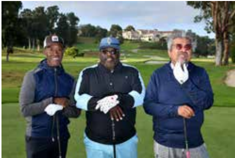
Don Cheadle, from left, Cedric the Entertainer, and George Lopez