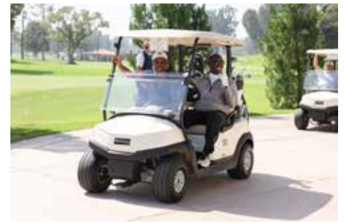
Sugar Ray Leonard, left, and Johnny Gill