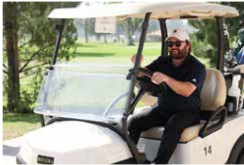
Haley Joel Osment